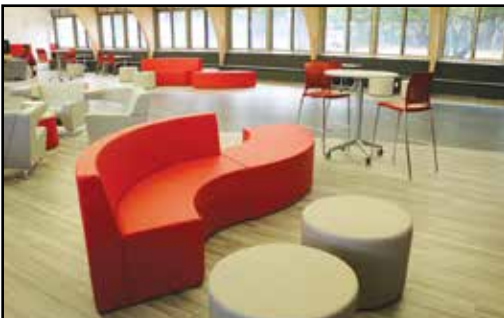
Remodeled Syosset High School student lobby.

year on the track and field, the high school security vestibule and the high school fitness center. Please be assured a safe environment for students and staff will be maintained while the work is completed, and steps are being taken to minimize noise and disruption. Please visit the District website at syossetschools.org/facilities for pictures and information on all the projects being done.