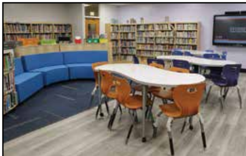
Modernized Walt Whitman Library.