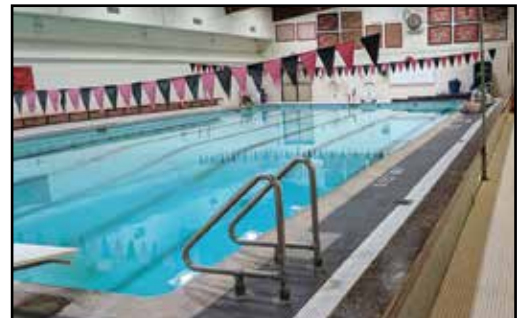
Renovated Pool Deck.